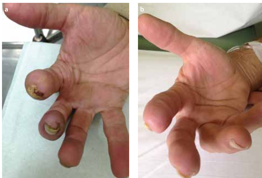
Figure 1. a, b. Clinical aspect of the hand of one Buerger's patient during the acute phase (a) and after 6-month treatment (b)

Our observations provide evidence of a severe rearrangement of the nailfold vasculature, consistent with a segmental, inflammatory vasculitis occurring in TAO. Capillaroscopic abnormalities during the acute early phase were similar in both patients, suggesting that these abnormalities could be related to TAO.